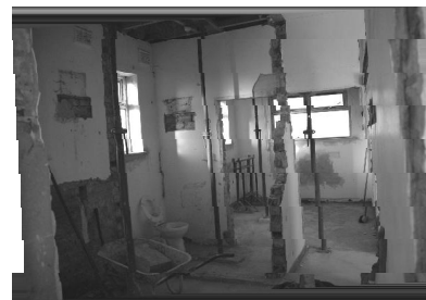
The Toilets knocked through