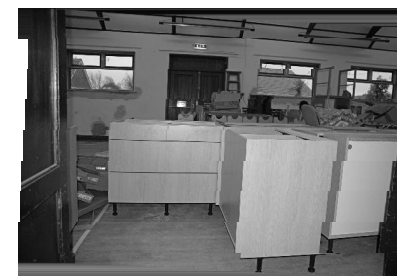
Kitchen units waiting to go in