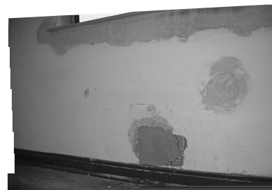
Making good the gas heater flue holes