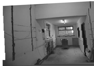
The Kitchen emptied