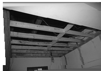
Lowered kitchen ceiling